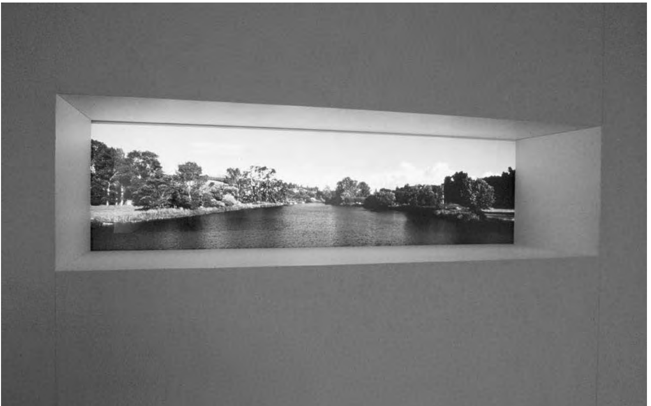
Top: Mladen Bizumic, Tauranga Guggenheim (Model and Drawings) , Artspace, 2002.